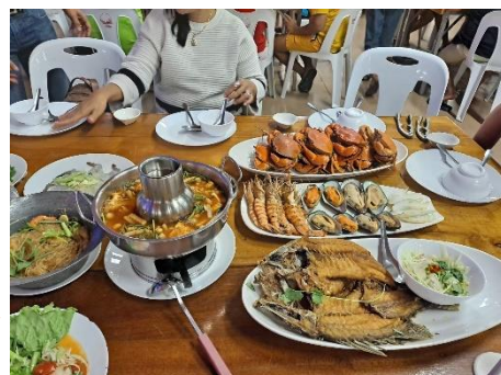
Thai large platter meals

Everyone, when you come to Thailand, I hope you challenge yourselves to experience things you can't experience in Japan, get to know Thailand, and have lots of fun!