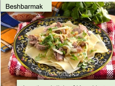
A national dish of Kazakhstan using mutton